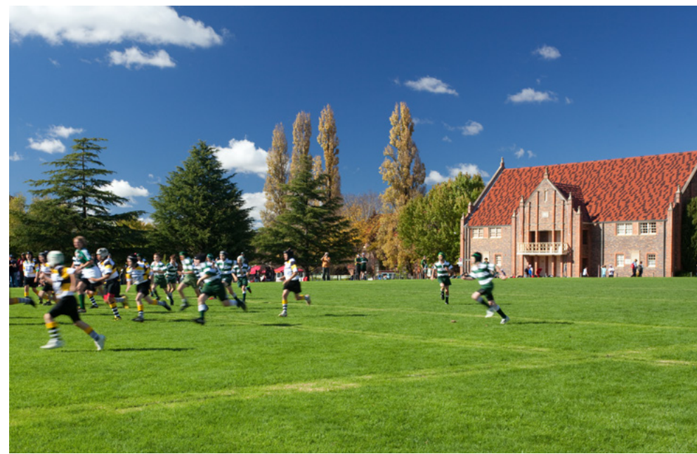
Rugby at The Armidale School

What's so appealing about Armidale is that it's a cosmopolitan and sophisticated urban centre located in a picturesque rural setting on the doorstep of some of the most scenic national parks in Australia.