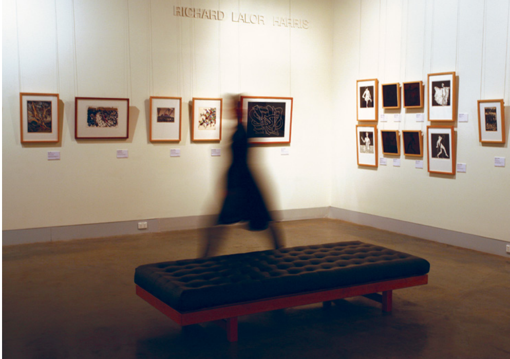
New England Regional Art Museum

Armidale differs from most inland regional centres because it has a long established university, transforming it from a rural town to a sophisticated and cosmopolitan city.