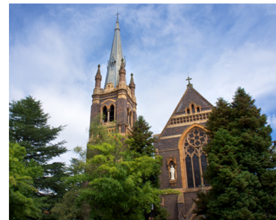
St Mary's Cathedral