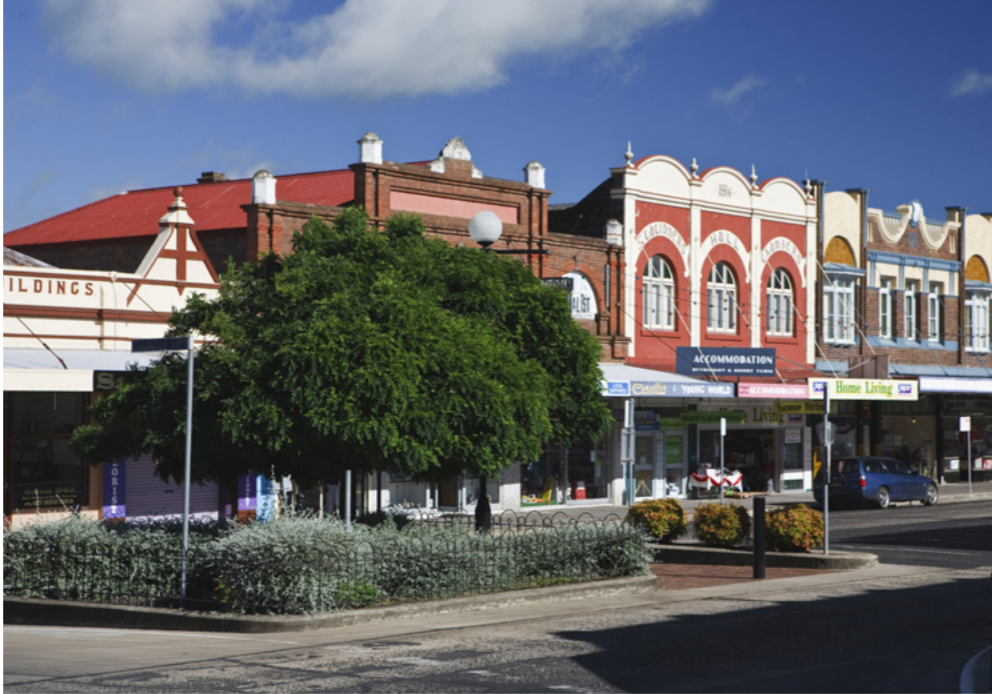
Glen Innes streetscape

Glen Innes Severn is a great place to raise a family with lots of wide open spaces, great schools and welcoming community atmosphere.