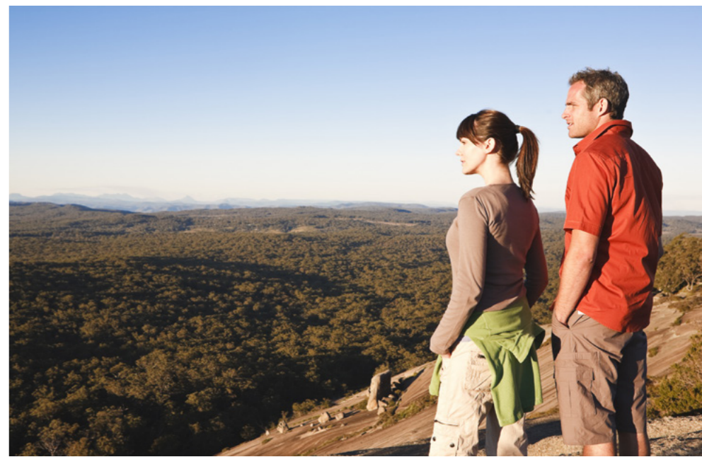
Enjoying the stunning lookout from Bald Rock

Expect the spectacular in Celtic Country – Glen Innes encompasses a breathtaking array of attractions, experiences, festivals and an endowment of natural wonders - from World Heritage national parks to some of the world’s richest gem fields.