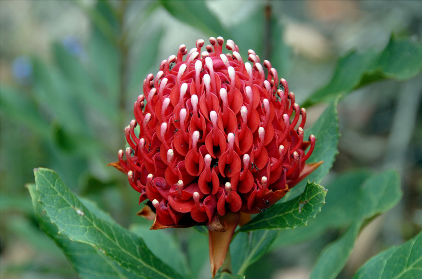
Warratah: Washpool National Park

Expect the spectacular in Celtic Country – Glen Innes encompasses a breathtaking array of attractions, experiences, festivals and an endowment of natural wonders – from World Heritage national parks to some of the world's richest gem and mineral fields.