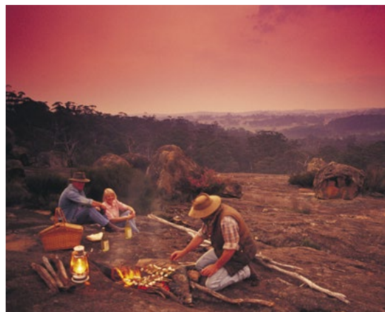
Guyra farm stay

Annual events include the Lamb and Potato Festival in January, the Guyra Show and Clay Target Competition in February, the Guyra Cup Horse Race in March, the Guyra Gun Club Annual Open Competition in July, the NSW Open Shooting Competition and the Rodeo in November.