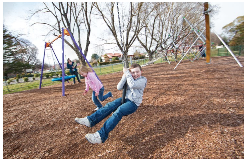
Rotary Park playground on the New England Highway

The Guyra District is unique because it is situated on the uppermost plateau of the Great Dividing Range in northern New South Wales